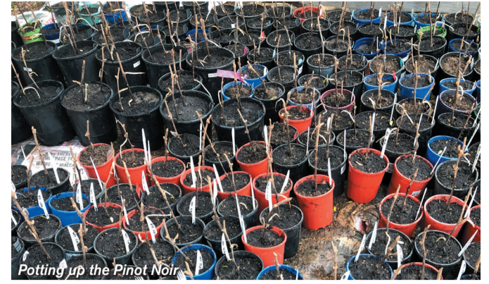
Potting up the Pinot Noir