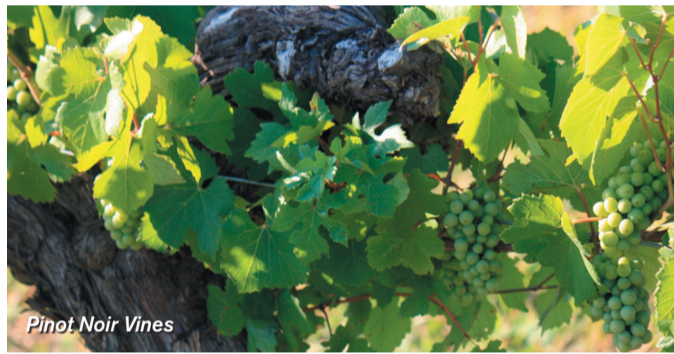
Pinot Noir Vines

James Busby is fondly referred to as the Father of Viticulture in Australia. In 1829, Busby left Australia at the Government's behest, to travel the world to collect vine cuttings to bring back to Australia and see what would work to establish a wine industry. Busby bought back cuttings from many different countries but the ones that are important to us, are the vine cuttings from Clos de Vogeot, in Burgundy, France.