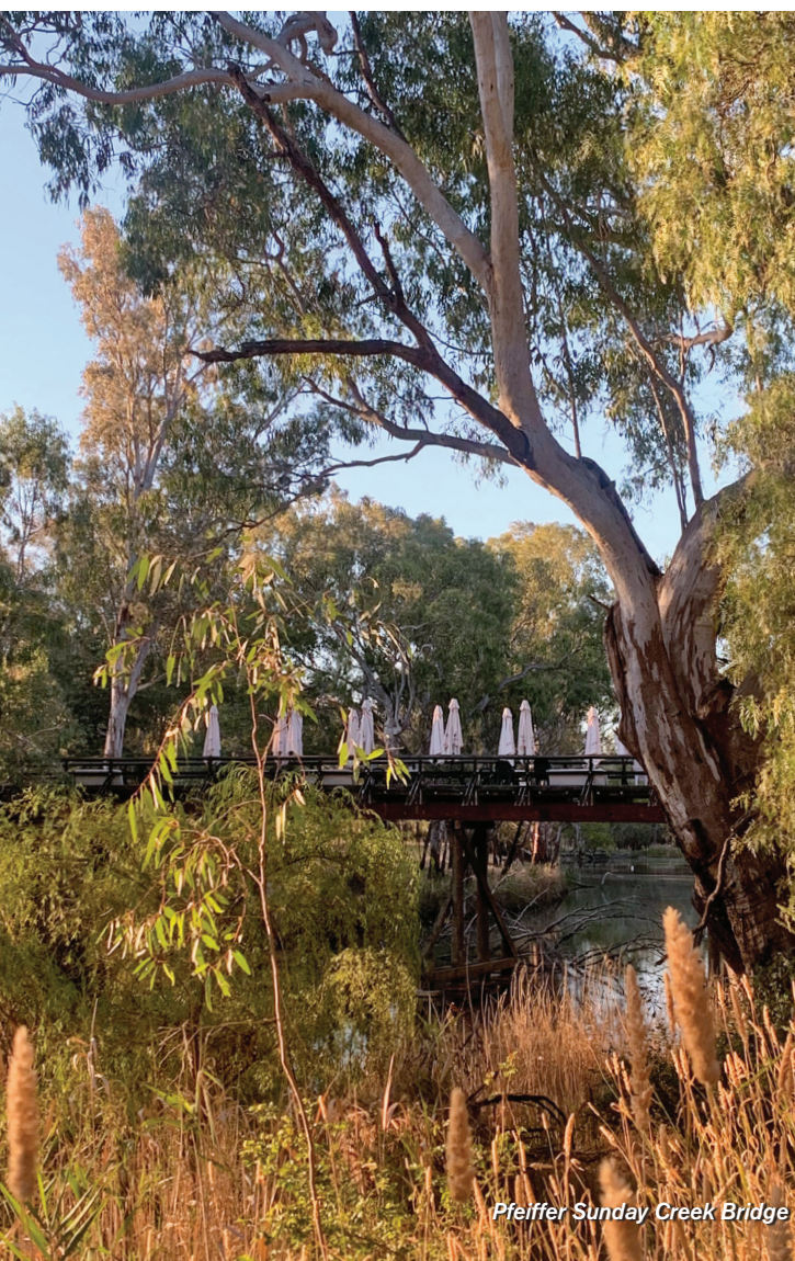
Pfeiffer Sunday Creek Bridge