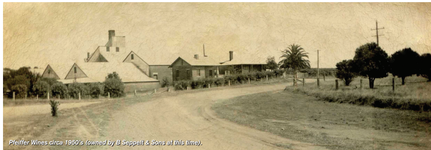
Pfeiffer Wines circa 1950's (owned by B Seppelt & Sons at this time).

Welcome to Pfeiffer Wines - the home of " Pfeiffer's pfine wine pfor pfine pfood and pfabulous pfolk "...YOU!